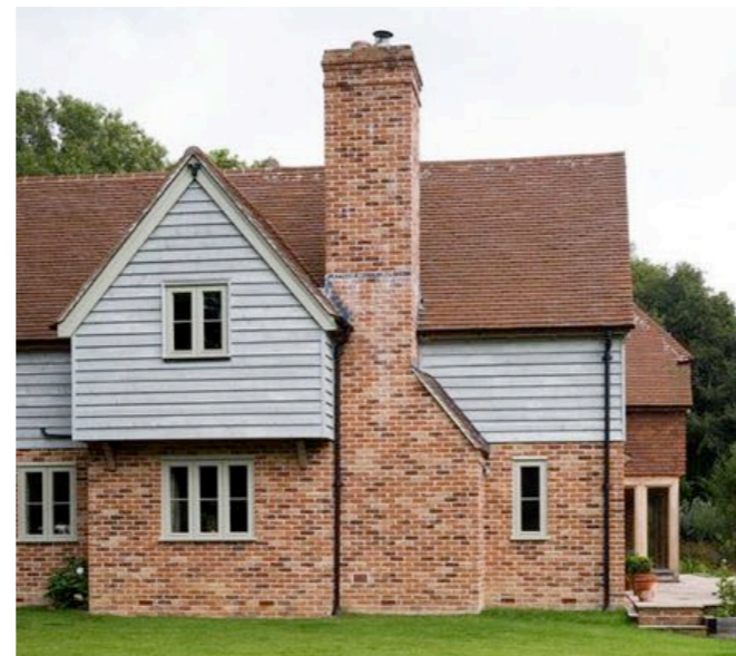
Weather-boarded Gables and Plain-clay Tiled Roof, by BorderOak.com