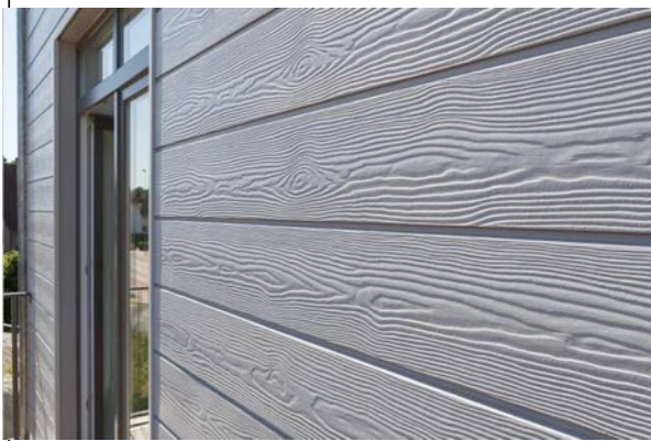
Factory Painted Fibre-cement Cladding by MarleyEternit.co.uk