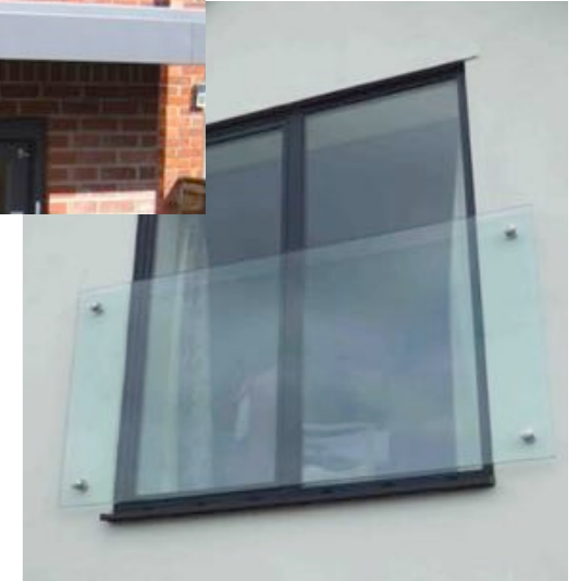
Frameless Juliette Balcony by SunrockBalconies.co.uk