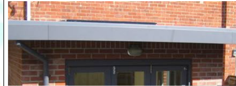
Aluminium Combined Eaves / Gutter System (for Flat Dormer Roofs) by Bailey-uk.com and HampshireArchitect.com.