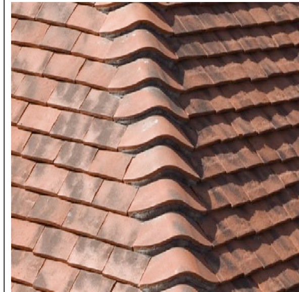
Plain Clay Tiles and Bonnet Hip Tiles by Redland.co.uk.