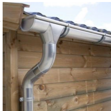
Zinc Guttering and Downpipes by Guttering-Expert.co.uk